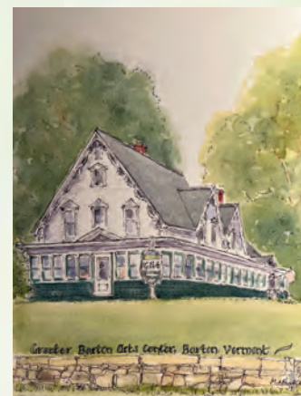
Greater Barton Arts Center

Greater Barton Arts Located off of Main Street in Barton, the center provides ongoing art activities, exhibits, lessons and live music performances in an intimate setting (greaterbartonarts.com).