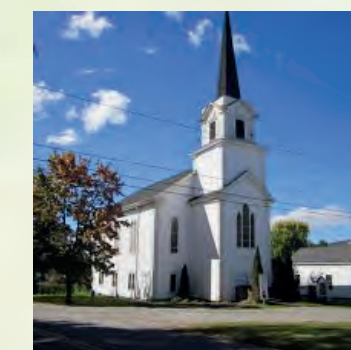
Irasburg United Church