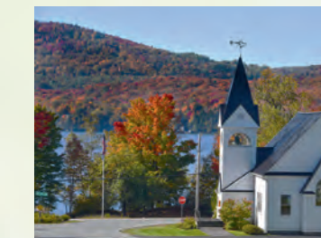
Westmore Community Church and Fellowship Hall