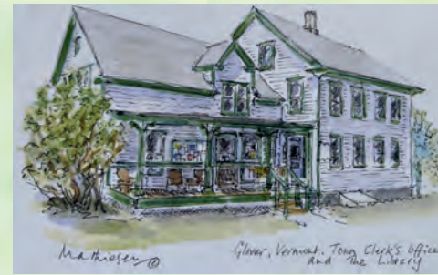
Glover Town Clerk's Office and Library