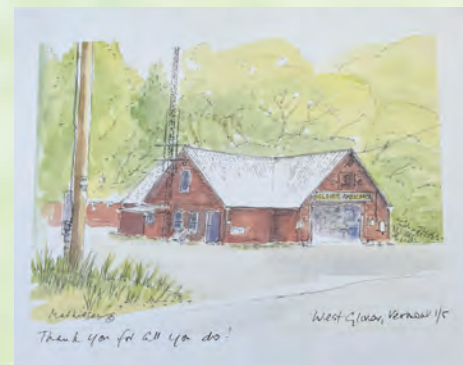
Glover Ambulance Building