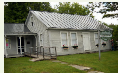
Pierce House Museum

Greater Barton Arts Located off of Main Street in Barton, the center provides ongoing art activities, exhibits, lessons and live music performances in an intimate setting (greaterbartonarts.com).