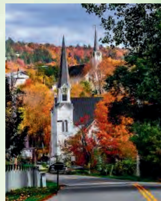
Fall Colors on Church Street