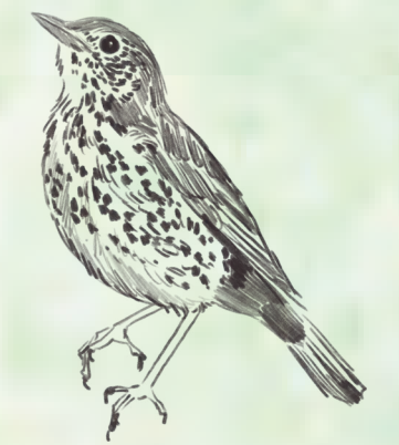
State Bird: Hermit Thrush

Artist Map of the Center of the Kingdom sponsored by the Barton Area Chamber of Commerce