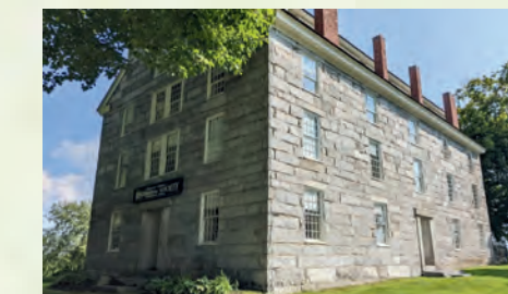
Old Stone House Museum & Historic Village

Old Stone House Museum & Historic Village Established in 1925, this museum chronicles the history of Northern Vermont through its collections, exhibits, and educational programs. Open seasonally from mid May through mid October, Wednesdays through Sundays, 11am - 4pm (oldstonehousemuseum.org).