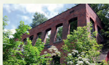
Brick Kingdom Trail

Pierce House Museum & Brick Kingdom Trail Founded in 1983, the museum houses artifacts and exhibits from Barton's rich industrial and agricultural past. Open June through September, Saturdays and Sundays 1-3 pm. Brick Kingdom Trail open during daylight hours (sites.google.com/site/bartonmuseum).