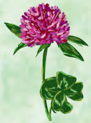
State Flower: Red Clover